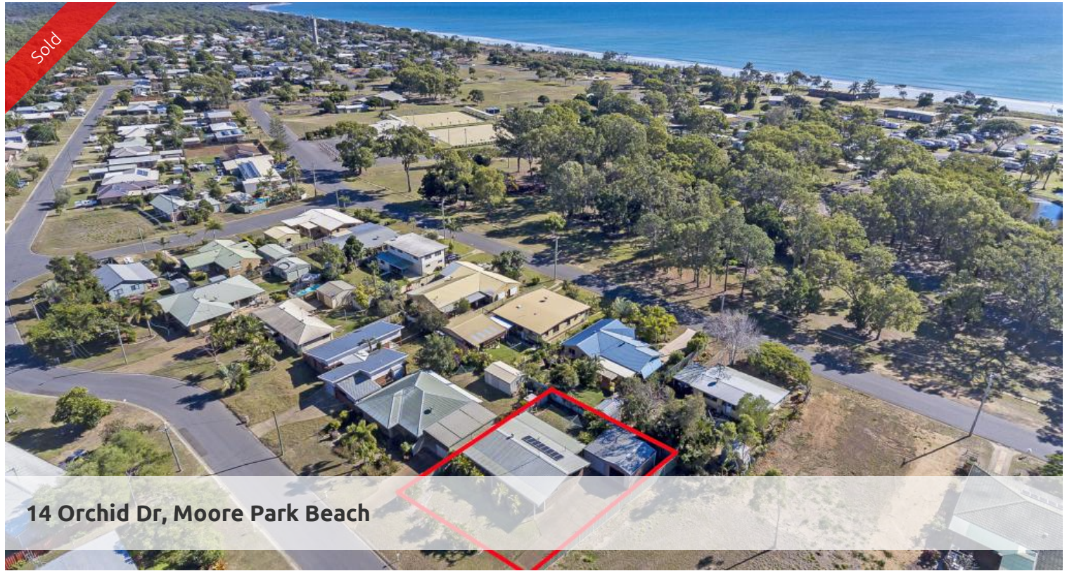
14 Orchid Dr, Moore Park Beach