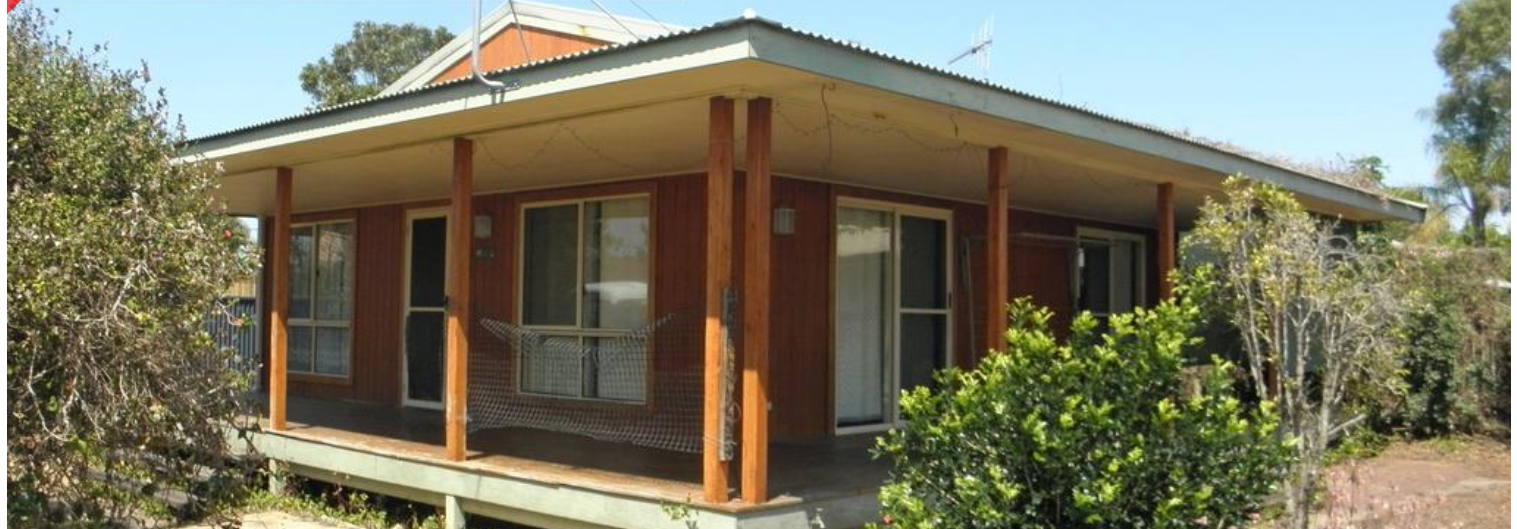
19 Tea Tree Ct, Moore Park Beach