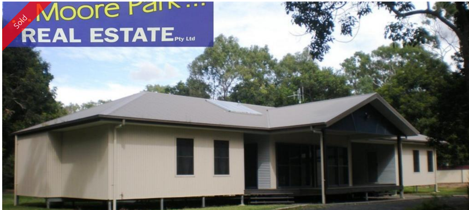
257 Sylvan Dr, Moore Park Beach